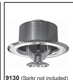
9130 (Sprkr not included)